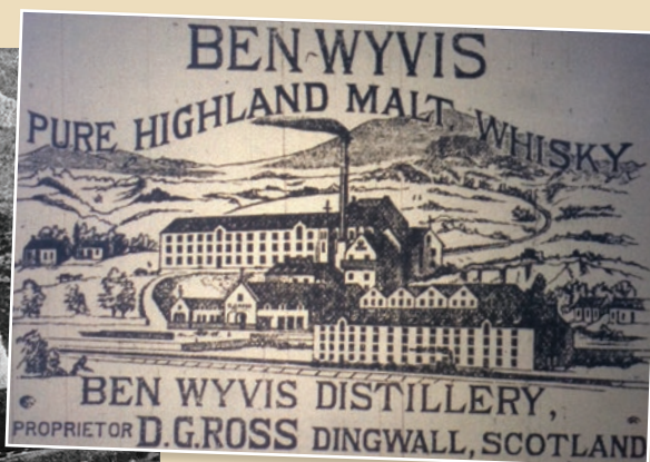
Above: Ben Wyvis advert 1882 Ross-shire Journal. Left: workers at Ben Wyvis Distillery