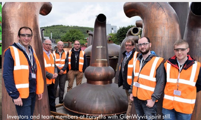
Investors and team members at Forsyths with GlenWyvis spirit still.

June was the most exciting month yet for the GlenWyvis Distillery build. The steel frame is up! James Evans and Sons Ltd are now busy fitting the cladding. This means that everything is on-track for the arrival of the distilling equipment later this month.