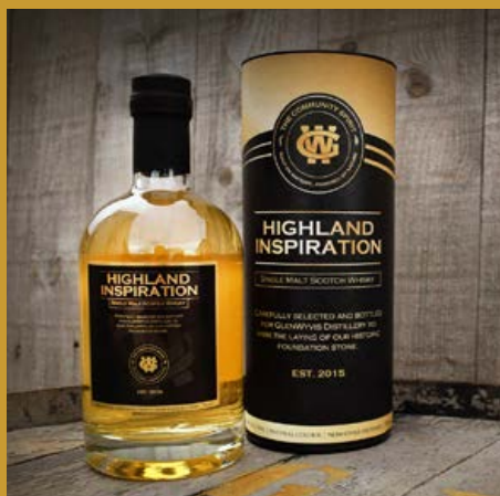
Highland Inspiration malt whisky.